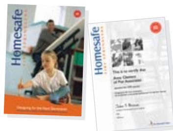
Informative reference guide and CPD training certificate

If you are interested in booking a seminar, please fax back the booking form as soon as possible.