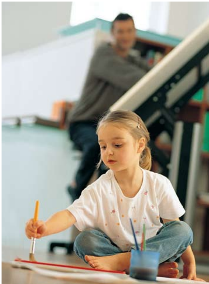
We have a duty to safeguard future generations by applying what we know to how we build