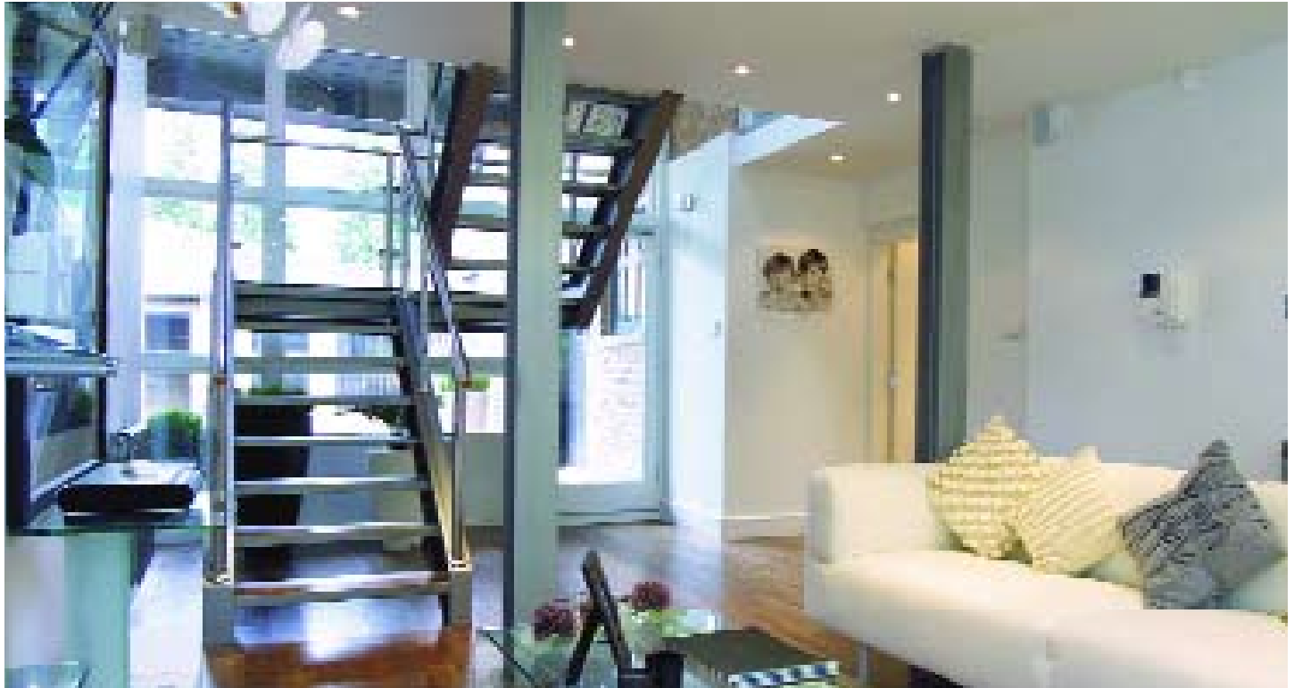
A second means to an end. Need a second means of escape? There is another way with fire engineered design

“The government and fire community do much to educate people to the dangers of fire in the home, where we sleep, work and in places where we resort. In the UK, Building Regulations provide functional requirements to confine fire spread. However, containing fire in a compartment is time dependent and will not confine a fire indefinitely, nor does it provide for the safety of the people, the contents or the fabric in that compartment.”