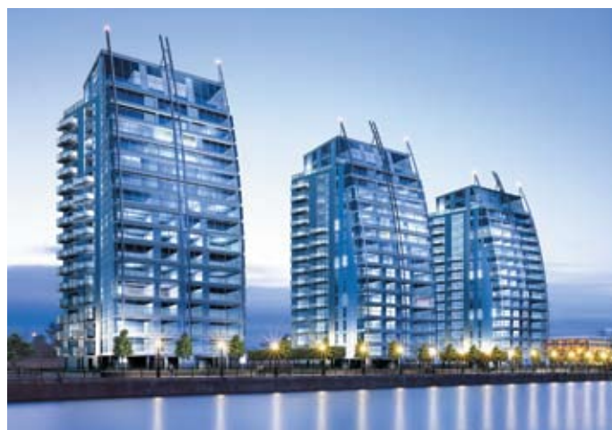
From protecting those unable to help themselves to achieving the "wow" factor of contemporary living