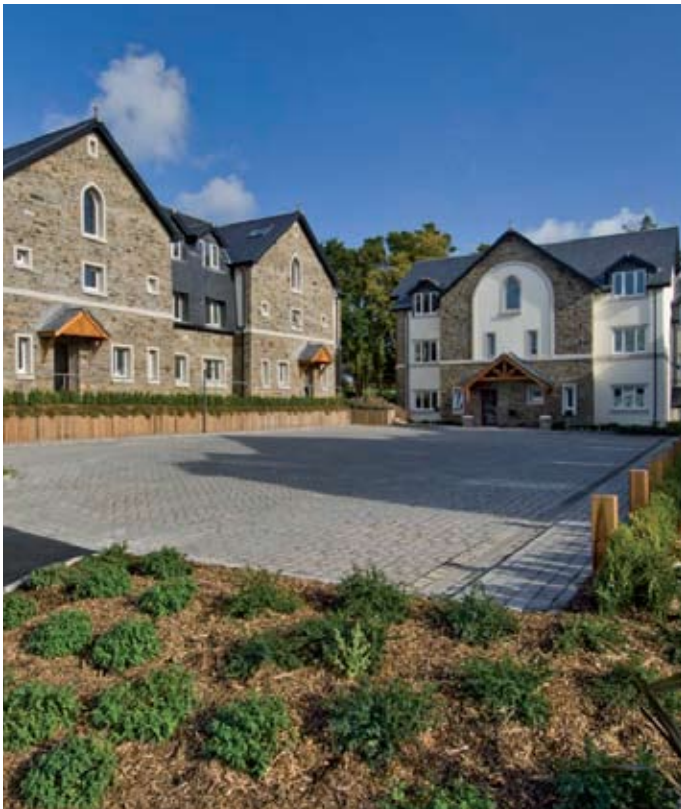
Greenflow favoured in fire engineered scenarios, due to additional reliability

Residential Application Valve set consisting of 50mm stop valve, 50mm backflow prevention device, alarm indicator, pressure gauge and a 25mm test valve.